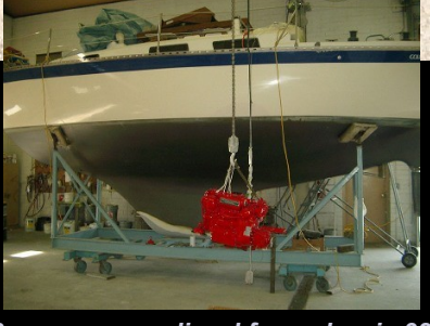
Repower: new diesel for a classic 32' sailboat-twice the power, less weight!