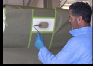
Meticulous attention to detail with our fiberglass repair work!