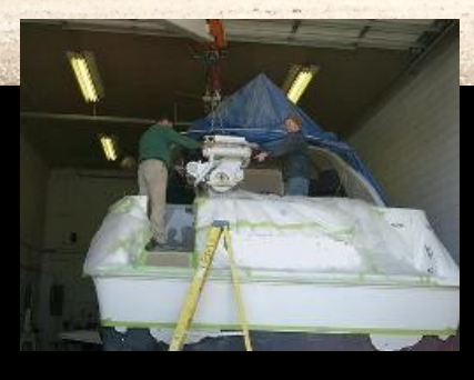
Removing the diesel engine from a 45' twin diesel inboard to facilitate structural repairs