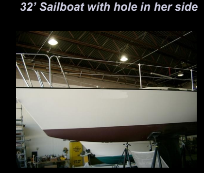
Same 32' Sailboat with repair work completed