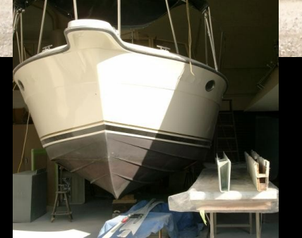
New fiberglass molded stringers being fitted to replace the built-in rotted plywood stringers on this 31' Twin Inboard